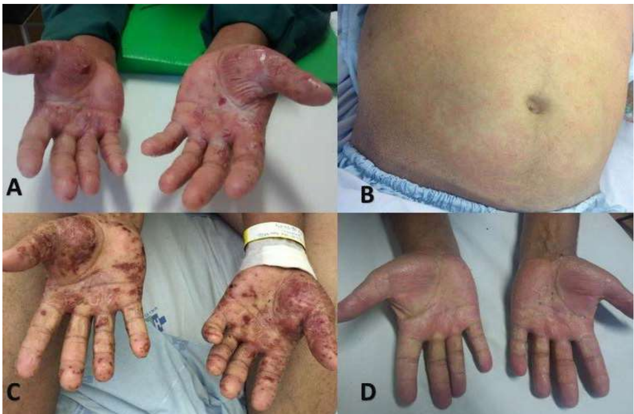
FIGURE 1. A) Erythematous, pruritic, scaly and flaky lesions on hands and B) abdomen (at tenth week of HCV treatment). C) Peeling areas, break blisters, skin fissures with bleeding and signs of secondary infection on hands (one week after the end of HCV treatment). D) Improvement of skin lesions after one week of a higher dose of prednisone and intravenous antibiotic.

A 49 year-old man with HCV related liver cirrhosis, genotype 1 and alcohol abuse was referred to our outpatient clinic for HCV therapy assessment. He was HCV treatment naïve, with arterial hypertension, diabetes, anxiety disorder and a tobacco user. He denied previous gastrointestinal bleeding, ascites or hepatic encephalopathy. He had a compensated liver function (Child-Pugh A, MELD 6), with a liver stiffness by Fibroscan® of 47.2 kPascal, compatible with Metavir F4 (cirrhosis). The upper digestive endoscopy revealed portal hypertension with esophageal varices. Baseline exams were as follows: hemoglobin: 15 mg/dL, leukocytes: 8,710/mm 3 , platelet count: 193,000/mm 3 , total bilirubin: 0.99 mg/dL [reference value (RV) < 1.2], urea: 41 mg/dL (RV < 43), creatinine: 0.9 mg/dL (RV < 1,2), alanine aminotransferase: 82 IU/L (RV < 50), aspartate aminotransferase: 48 IU/L (RV < 50), alkaline phosphatase: 117 IU/L (RV < 120), gamma glutamyl transferase: 300 IU/L (RV < 38), albumin: 4.0 g/dL (RV 3.5-5.2), INR: 0.9 (RV